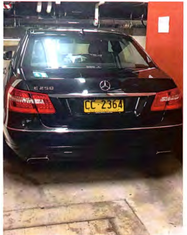
MERCEDES BENZ E250 CGI SALOON MODEL 2011 BLACK